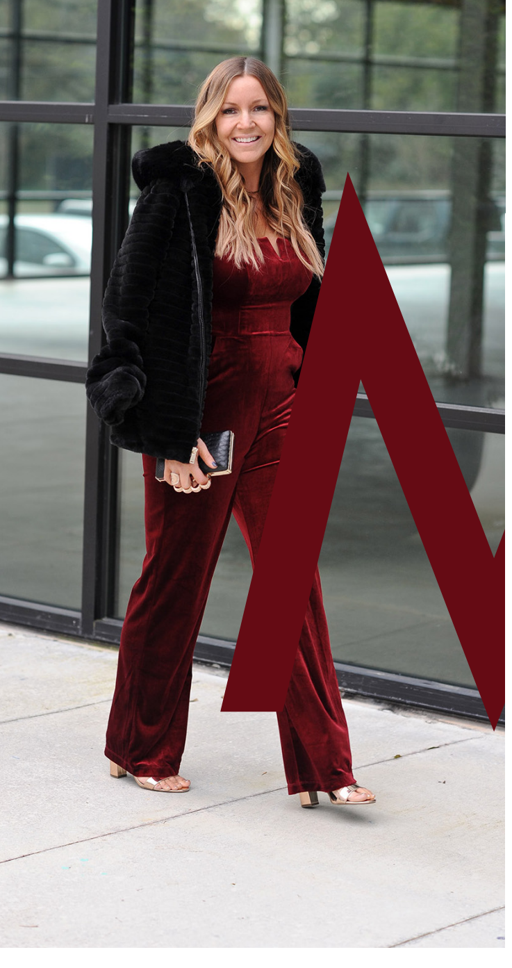
Join me on this crazy adventure by reading this blog, following me on Facebook, Twitter, Instagram, Snapchat and any of the other various social media outlets that will inevitably make me feel old. (I mean, you'll have to tell me about them first.)